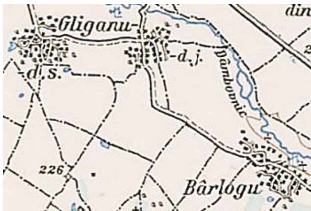
Figure 2. Austrian Map (1910). Scale: 1:200 000

Alongside numerous villages, Liviu Rebreanu also used two rivers to mark off the space where the most important events are taking place. The two water courses named Teleorman and Valea Câinelui are the only natural features drawn by Liviu Rebreanu. Both of them are running through the southern part of Argeș County but, at a closer look, only the river of Teleorman is placed correctly on the map. This conclusion was drawn following the course of the river and the name of the adjacent villages. On the other hand, Valea Câinelui is just a small creek in reality, which flows several kilometres westward of Teleorman. If it was for the author to draw a real map, eastward of Teleorman, he should have placed the river of Dâmbovnic, in a different drainage basin. A sketch from the author's personal archive indicates that initially, he thought of using other small creeks from the