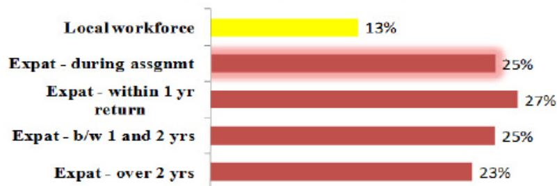
Figure 1: Annual Turnover Rates. High turnover among corporate expatriates

of professionals, as determined by economic and organizational imperatives, requires a cultural and psychosocial match in order to succeed. A nomadologic mind and networks are thus required for confronting, seizing and making sense of the types of challenges posed by irregular mobility (D'Andrea 2006; Malkki 1992). Mobility is not just the displacement of objects but also of a generative grammar culturally posited by the mobile subject. Attrition expatriate rates thus pose a challenge to an objectivist-materialist approach of mobility, requiring a multidimensional approach to complexity (Urry 2007).