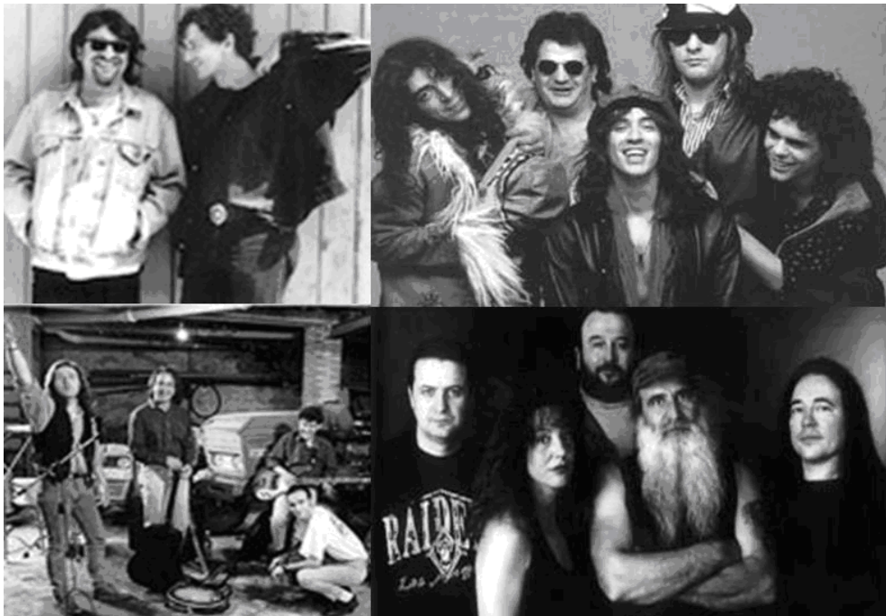
Figure 2. Sau (top left), Sopa de Cabra (top right), Els Pets (bottom left), and Sangtraït (bottom right).

Meanwhile, the Catalan public TV broadcasting corporation (CCRTV) started to air Catalan pop-rock music, but not punk-rock. Together with what has been pointed out till now, it should also be mentioned that the local cultural industry aimed to strengthen teenage fans’ phenomenon by supporting those groups that were just singing in Catalan, such as Sopa de Cabra, Sau, Els Pets, and Sangtraït (Gendrau, 2000:215).